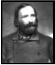
General Giuseppe Garibaldi

Garibaldi was one of the greatest Italian patriots of all time and definitely the most famous soldier of the Risorgimento. He personally led many of the crucial military campaigns that brought about the formation of a unified Italy in 1861. He is called The Hero of the Two Worlds , a