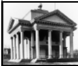
Garibaldi-Meucci Museum, Staten Island, circa 1910

Garibaldi eventually managed to escape abroad. He met Antonio Meucci, true inventor of the telephone, in 1850 and became a resident of New York. Both men lived in the Gothicrevival style, 160-year old house that is now the Garibaldi-Meucci Museum, Staten Island, and worked as candlemakers for some time.