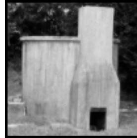
Dipping vat used by Meucci and Garibaldi in the 1850's

Garibaldi returned to Italy again in 1854. He was appointed Major General of the Austro-Piedmontese War in 1859 and formed a volunteer unit called the Hunters of the Alps. Together they were victorious over the