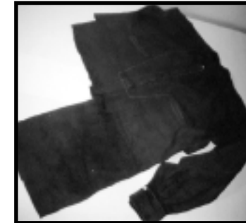
Garibaldi's fighting uniform, or "Red Shirt"

Garibaldi then advanced to Palermo, Sicily's capital, and launched a siege on May 27. He won a signal victory and gained worldwide fame and the respect of many Italians. Local rebels joined Garibaldi's army and they were able to defeat a three thousand-strong, Bourbon French garrison at Calatafimi.