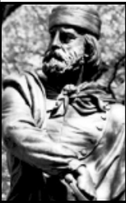
Statue of Garibaldi in Washington Square Park, Lower Manhattan

"Obbedisco," "I obey." After the war, Garibaldi led a political party that agitated for the capture of Rome. In 1867, he marched on Rome once again but was matched with a strong Papal army supported by a French auxiliary force. Garibaldi was defeated, taken prisoner and held captive for some time. He eventually returned to Caprera. When the Franco-