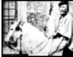
Garibaldi on horseback, circa 1860

At the outbreak of the American Civil War in 1861, Garibaldi volunteered his services to President Abraham Lincoln and was invited to serve as a Major General in the Union